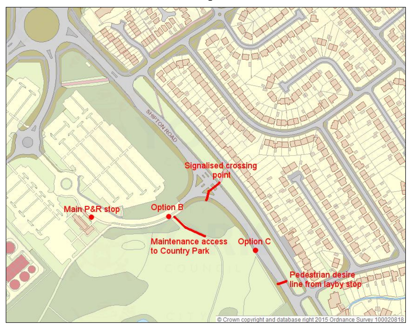
Figure 2: Map showing locations of options B and C.